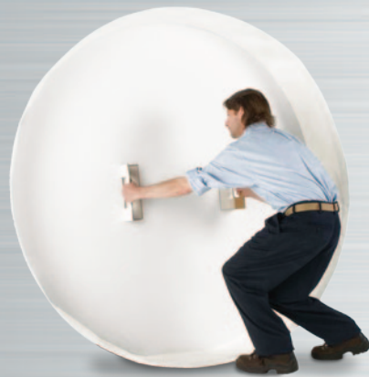
US & Foreign Patents Issued & Pending

EZ Purge® is a pre-formed, self-adhesive, water soluble purge dam that enables welders to save time on weld preparation as well as improve project timeliness. Since EZ Purge® is pre-formed; there is no need to measure, cut or construct a purge dam. Setup and installation time is completed in minutes, making EZ Purge® the most efficient and economical purge dam available.