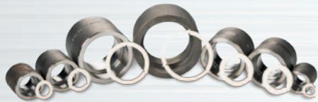
US & Foreign Patents Issued & Pending

SoluGap® Water Soluble Socket Weld Spacer Rings are made of EPA Approved Aquasol® Water Soluble Board. Dissolves completely and rapidly in most liquids. Unique tabs secure placement regardless of orientation. Compatible with any metal.